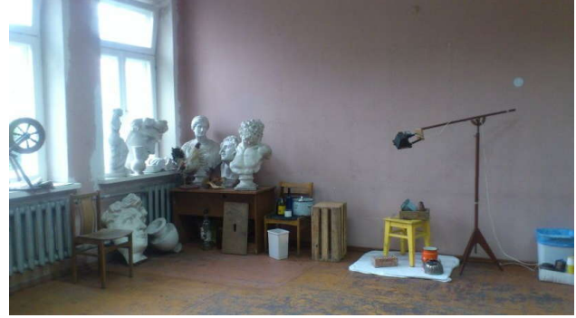
Kaunas Art School premises

• CreArt is a collaboration between the 13 European cities: Arad/Romania, Kaunas/Lithuania, Genoa/Italy, Delft/the Netherlands, Harghita County/Romania, Valladolid/Spain, Aveiro/Portugal, Linz/Austria, Kristiansand/Norway, Lecce/Italy, Pardubice/Czech Republic, Zagreb/Croatia and Vilnius/Lithuania.