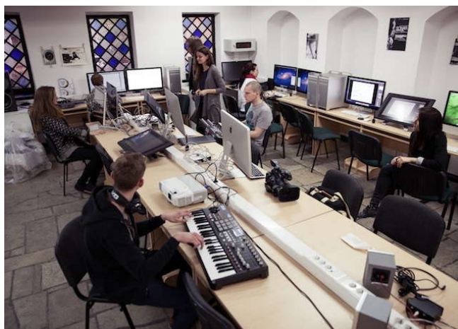
Vytautas Magnus University Lab